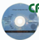
CANopen Configuration Suite