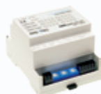
CANopen I/O module series